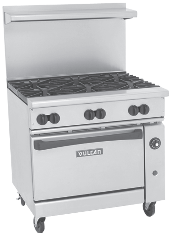
Model G36S-6 shown with optional casters